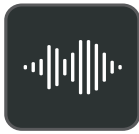
Optima Audio Experience