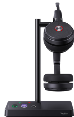
WH62 Dual Teams WH62 Dual UC

Based on hundreds of headform evaluations and thousands of wearing comfort tests, WH62 well meets the ergonomic requirements. Besides, with premier soft leather cushions and lightweight design, you can wear it all day comfortably. For more workspace freedom, WH62 can also free you up to 160m away from the desk.