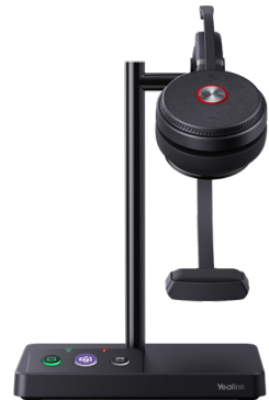
WH62 Mono Teams WH62 Mono UC