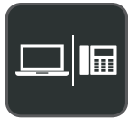
Multiple Devices Connection