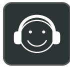
All Day Wearing Comfort