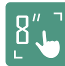
8-inch Multi-touch Screen