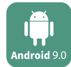
Android 9.0 OS