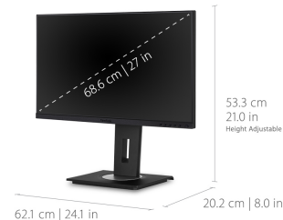
WQHD (2560x1440p) Resolution