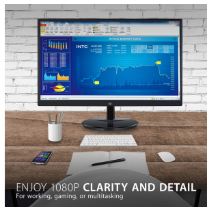
27" Full HD 1080p SuperClear® IPS panel with slim bezel design.