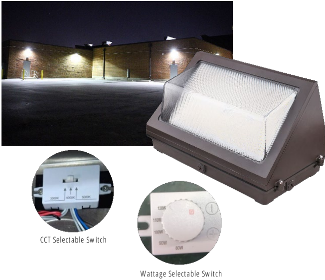
CCT Selectable Switch