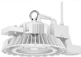
S1/S2 Factory Installed Sensor