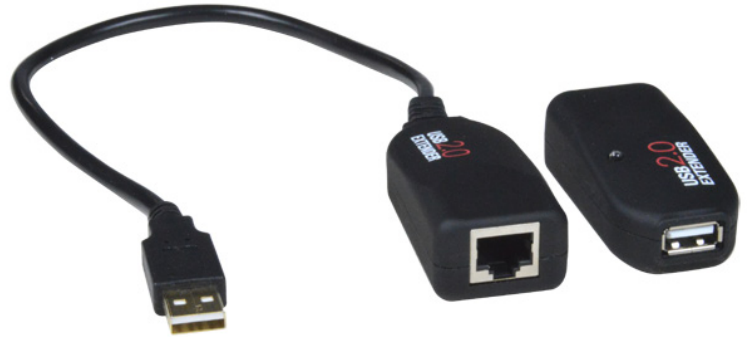
XTENDEX® USB2-C5-LCND (Local & Remote Unit)