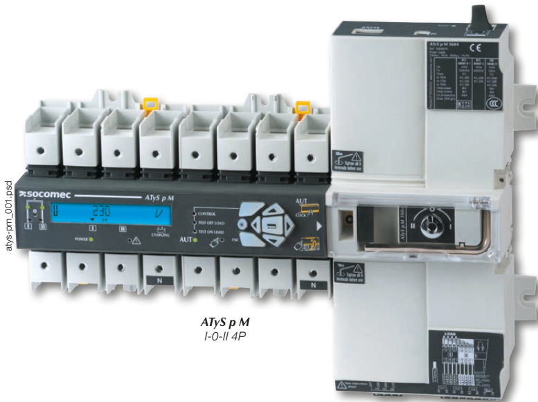
ATyS p M I-O-II 4P