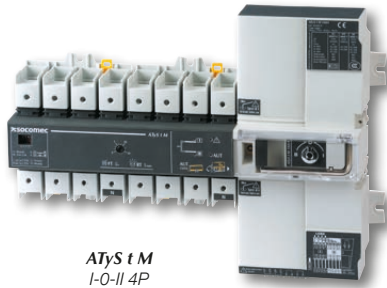
ATyS t M 1-0-II 4P