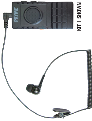
KIT 1 SHOWN

For use with Harris 2-way radios with built-in BT