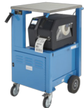
Powered Mobile Print Cart