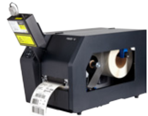
Online Data Validator (ODV)