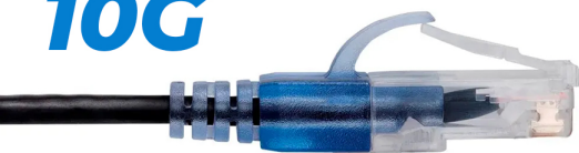
SlimRun CAT6A 3.6mm