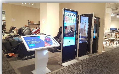
Las Vegas Furniture Show