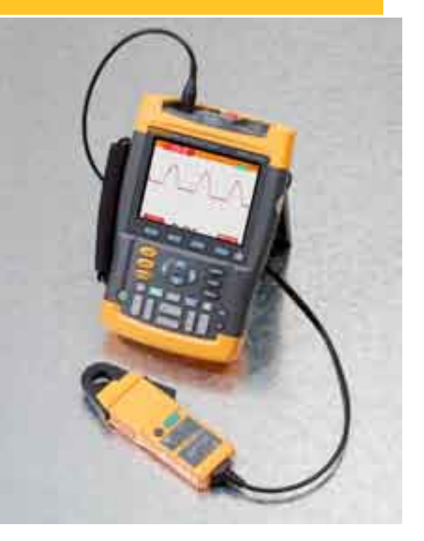
i30s connected to a Fluke 199C ScopeMeter.