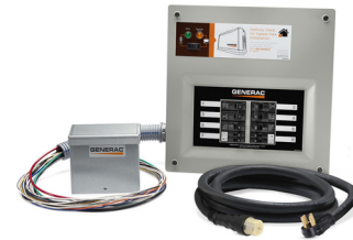
50 AMP Pre-wired Switch Kit Model 9855