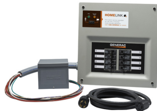
30 AMP Pre-wired Switch Kit Model 6853