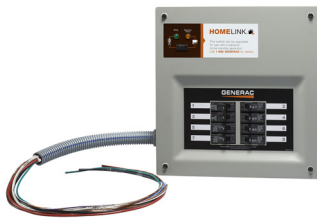
30 AMP Pre-wired Switch Model 6852