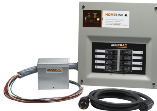
30 AMP Pre-wired Switch Kit Model 6854