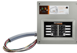
50 AMP Pre-wired Switch Model 9854