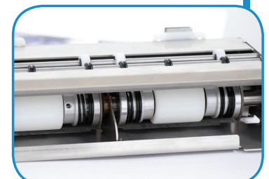
Heavy-duty cutting cassettes are interchangeable in seconds