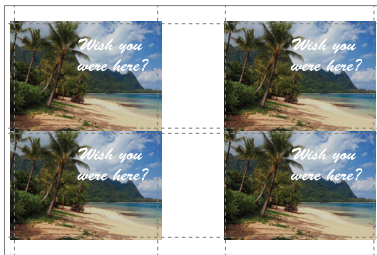
4-up 5" x 7" Postcards Optional FC-XL30 - 5" Cassette