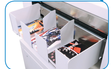
Adjustable catch tray accommodates a variety of finished card sizes