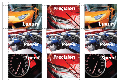
9-up 3.5" x 5" Postcards Standard FC-XL05 - 3.5" Cassette