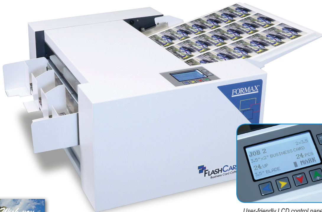
User-friendly LCD control panel