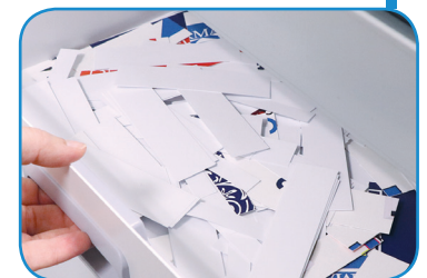
Waste bin collects paper scraps and is easy to empty

Formax - New Hampshire, USA www.formax.com