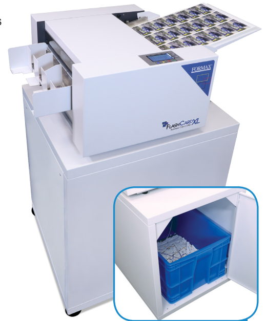
Shown on optional cabinet with casters and high density waste bin