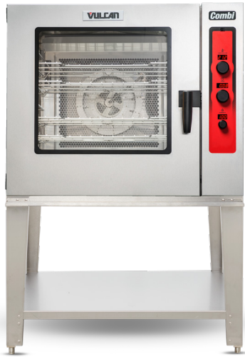
Model ABC7G Shown on stand