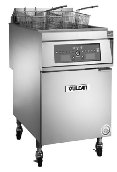
Model 1ER85C Shown with caster accessory