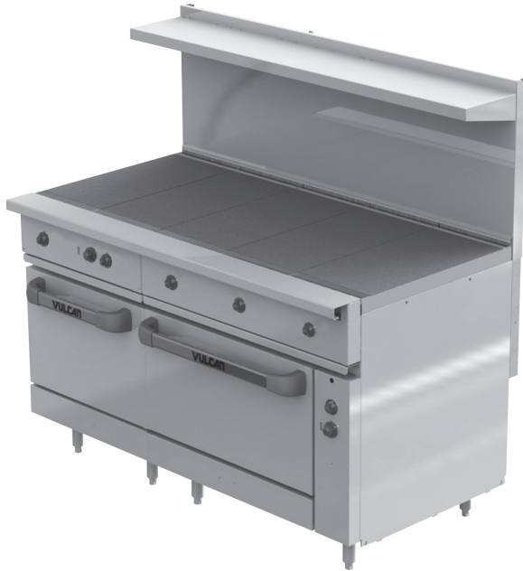
Model EV60SS-5HT208 Shown with adjustable legs