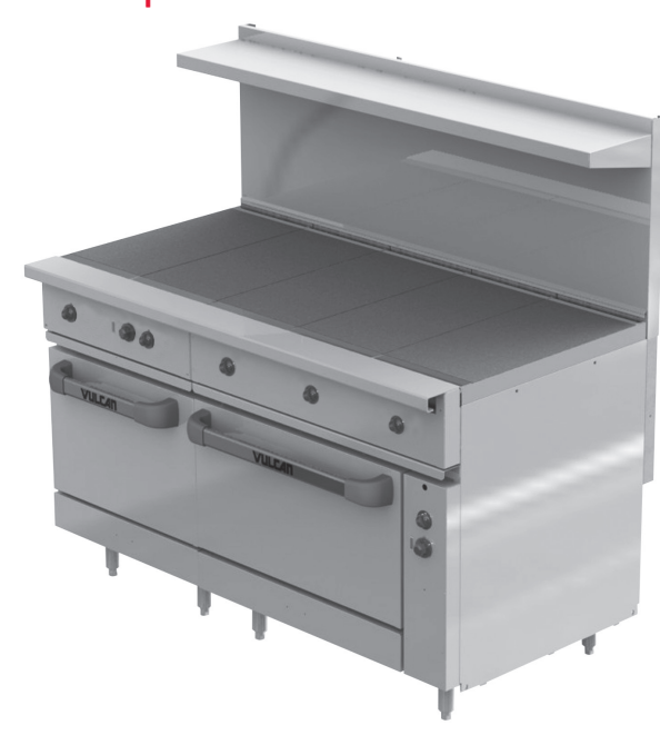
Model EV60SS-5HT208 Shown with adjustable legs