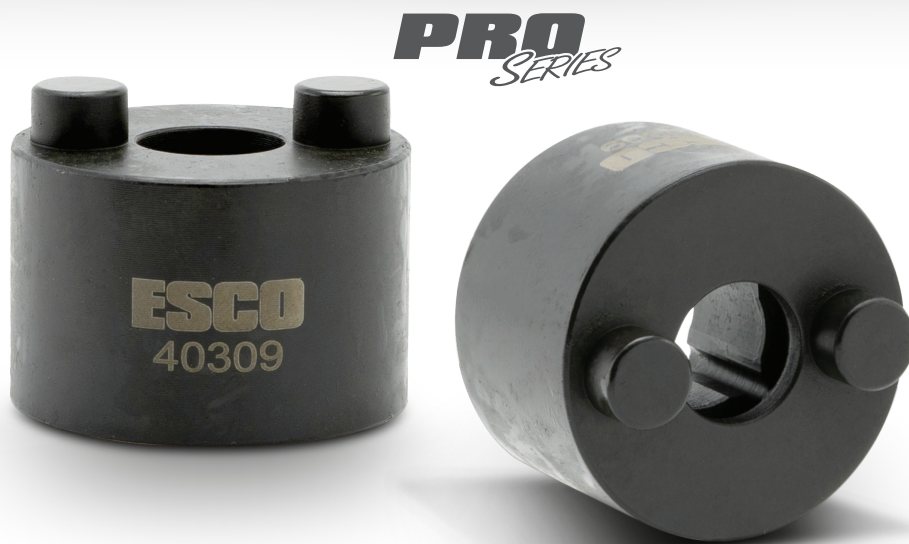
MODEL 40309 Mack/Volvo Leaf Spring Pin Specialty Socket

Designed for Mack/ Volvo with precision to save time and money.