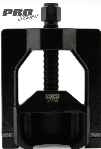
MODEL 40300 Heavy Duty U-Joint Puller

Eliminate the use of dangerous vice-and-socket or hammering methods.