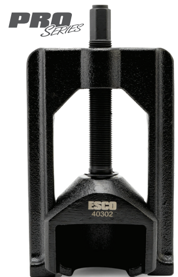
MODEL 40302 Automotive U-Joint Puller