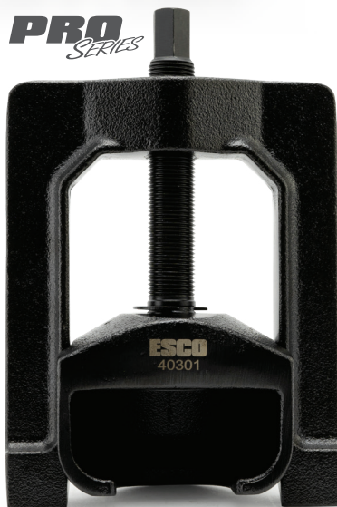
MODEL 40301 Medium Duty U-Joint Puller