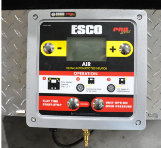
Step 1. Begin with unit powered off.