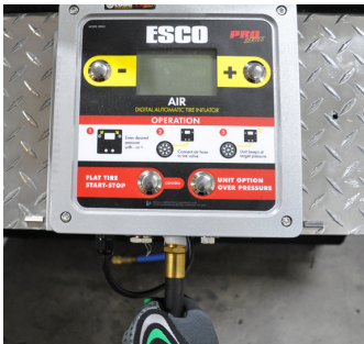
Step 3. Connect 1/2" outlet hose assembly directly to inflator air outlet.