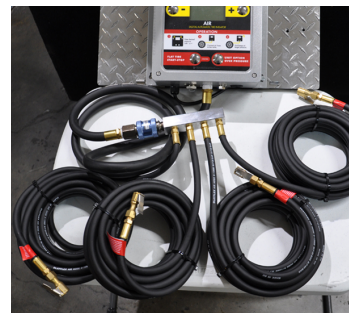
Completed 4-hose manifold assembly.