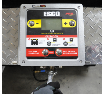
Step 2. Remove 1/4" outlet plug.