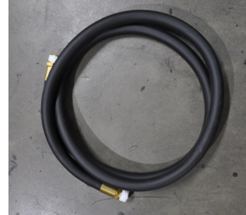
Step 3. Apply teflon tape to both ends of 1.8 m 1/2 outlet hose.