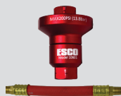
Air Reducer 110 psi -extends life of pump