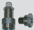
Hydraulic Coupler(s) Male, Female, Quick-Connect