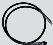
Hydraulic Hose(s) 8-18ft length