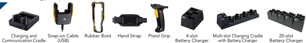
Charging and Communication Cradle