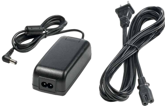
AD-SA1230XA AC Adapter Power Supply