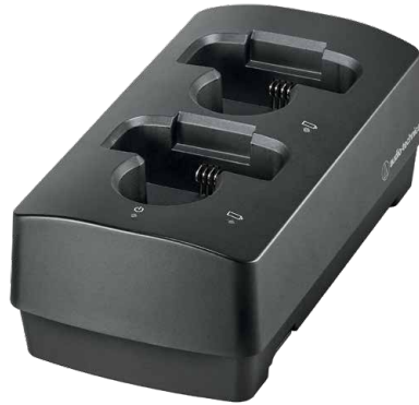
ATW-CHG3N Two-bay Network-enabled Charger