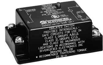
Single Channel Isolated Switch