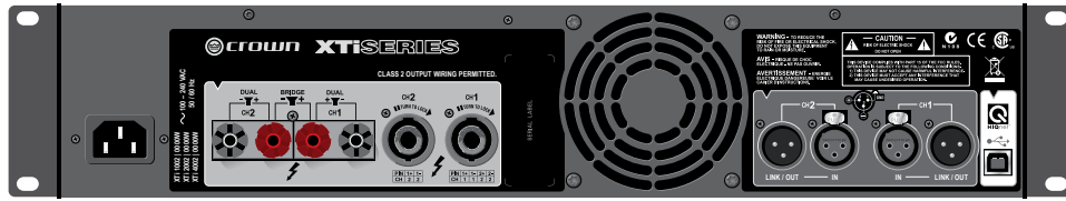
XTi 1002, 2002, 4002