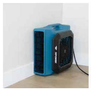
Against Wall: Idea for drying wet area along wall