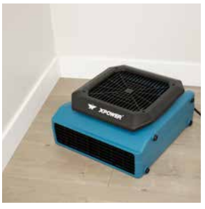
Flat: Ground level carpet and flooring