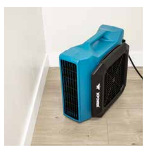
Side Placement: Water wick into walls/baseboard