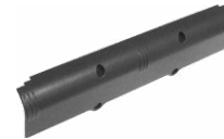
Battery pack 4xLR14