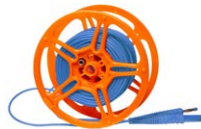
Test lead 15 / 25 m on a reel, banana plugs, blue