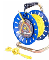
Test lead on a reel yellow 75 m / 100 m / 200 m

WAPRZ075BUBBSZ WAPRZ100BUBBSZ WAPRZ200BUBBSZ