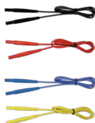
Test lead 1.2 m (banana plugs) black / red / blue / yellow

WASONBUOGB1 WASONREOGB1 WASONBLOGB1 WASONYE0GB1