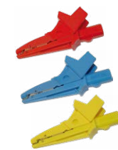
Crocodile clip 1 kV 20 A red / blue / yellow

WAPRZ1X2BLBB WAPRZ1X2REBB WAPRZ1X2BUBB WAPRZ1X2YEBB