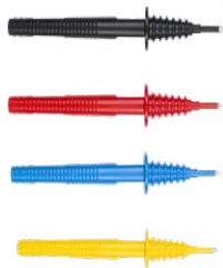
Pin probe 1 kV (banana socket) black / red / blue / yellow

WASONBUOGB1 WASONREOGB1 WASONBLOGB1 WASONYE0GB1