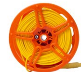
Test lead 50 m for earth resistance measurements (banana plugs) yellow