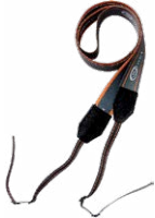
M1 hanging straps