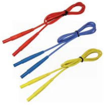
Test lead 1.2 m (banana plugs) red / blue / yellow