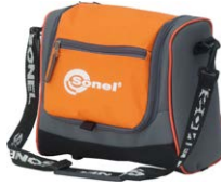
M6 carrying case