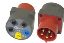
Three-phase socket adapter 16 A / 32 A