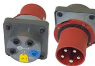
Three-phase socket adapter 63 A