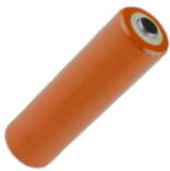
4x LR6 1.5 V battery