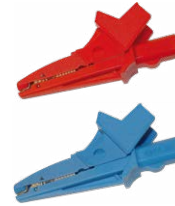
Crocodile clip 1 kV 20 A red / blue