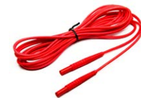
Test lead for fault loop measurement (banana plugs) 5 m / 10 m / 20 m