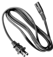
IEC C7 power plug WAPRZLAD230US