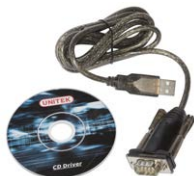
USB/RS-232 adapter WAADAUSBR232