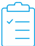
Calibration certificate with accreditation