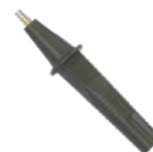
2x double-tip Kelvin probe (banana sockets) WASONKEL20GB