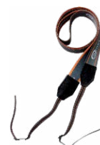
M1 hanging straps (TDR-420)