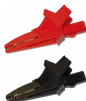
crocodile clip 1 kV 20 A red / black