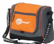
M-6 carrying case (TDR-420)