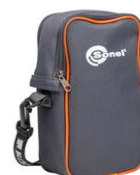
M-13 carrying case (TDR-410)