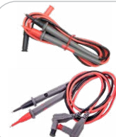
Set of test leads