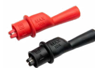
Crocodile clip mini, 1 kV 10 A (set)