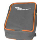
S1 carrying case