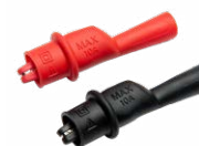
Crocodile clip mini, 1 kV 10 A (set)