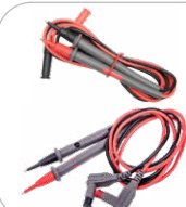
Set of test leads