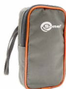
S1 carrying case WAFUTS1