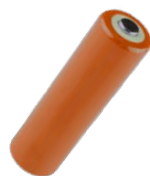
2x LR03 AAA 1,5 V battery