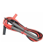
Test leads set for CMM (CAT IV, S) WAPRZCMM1