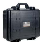
XL8 carrying case WAWALXL8