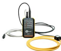
ERP-1 adapter with FS-2 flexible clamp and case WAADAERP1V2