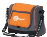
M6 carrying case WAFUTM6