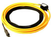
FS-2 flexible clamp (fi 1260 mm), output level 100 mV / 1 A WACEGFS20KR