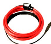
FSX-3 flexible clamp (fi 630 mm), output level 300 mV / 1 A WACEGFSX30KR