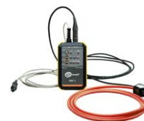
ERP-1 adapter with FSX-3 flexible clamp and case WAADAERP1V3