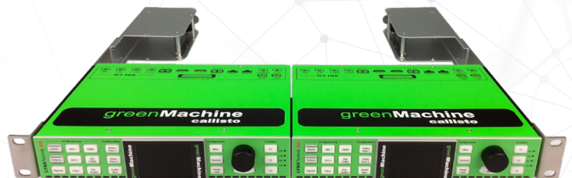
Two greenMachines setup