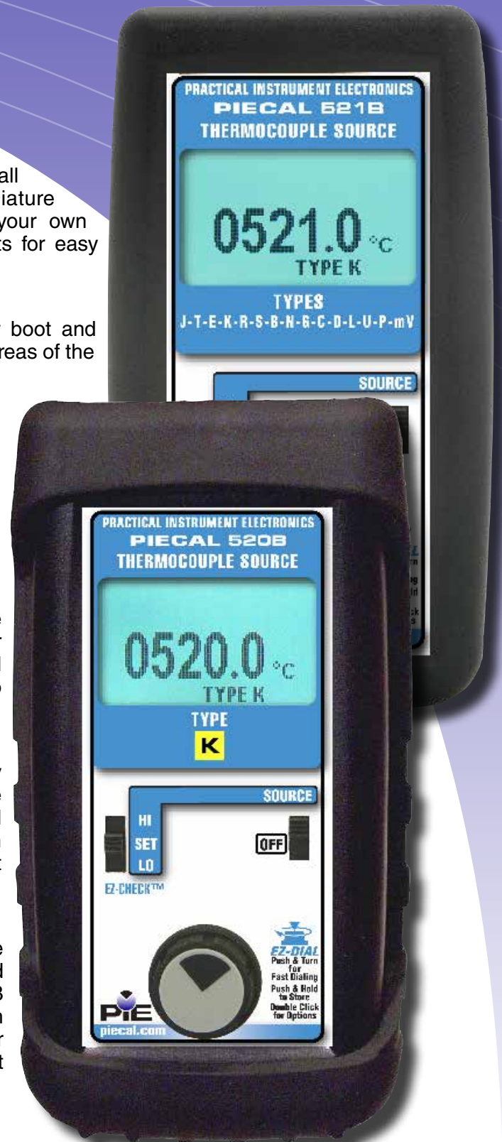
Actual Size (Shown with optional boot)