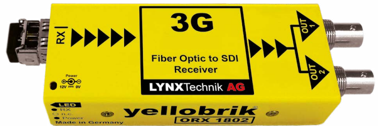
ORX 1802-2 LC Version Shown