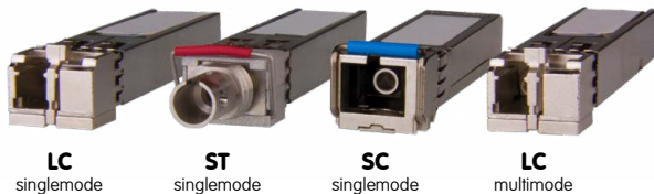
Using the same basic module we provide four versions suitable for LC, ST or SC singlemode fiber connections, as well as a version for multimode fiber. Each version has a different SFP installed.

The ORX 1802-2 provides 2 SDI outputs and support for LC, ST or SC singlemode fiber connections as well as an LC version suitable for multimode fiber. It will also auto-detect and re-clock any 270Mbit/s, 1.5Gbit/s and 3Gbit/s SDI fiber source and convert to an electrical signal. The module is fully compatible with 3G Level A and Level B formats.