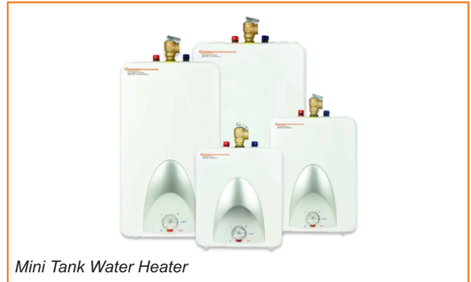
Mini Tank Water Heater

The Chronomite Mini Tank Water Heaters can be used in most under the counter, point of use applications. Models CMT-1.3, CMT-2.5, CMT-4.0 and CMT-6.0 are designed to supply hot water for all Hand Wash and Kitchen Sinks in a residential, commercial or industrial environment. These heaters can replace traditional central hot water heaters thereby conserving water and reducing energy waste. The Chronomite Mini tank Water Heaters are lightweight, compact, manufactured for easy installation, and designed to be mounted on the wall.