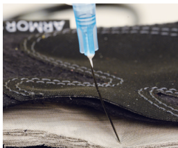
25 gauge needle buckling