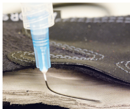
25 gauge needle failure