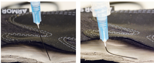
25 gauge needle buckling