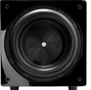
SLAPS Passive Radiator