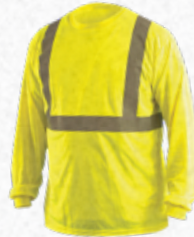
LONG SLEEVE (NO POCKET) LUX-LSET2B