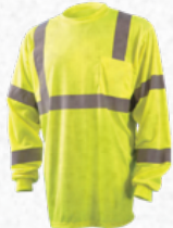
LONG SLEEVE LUX-LSETP3B