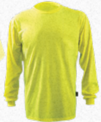
LONG SLEEVE LUX-XLSPB