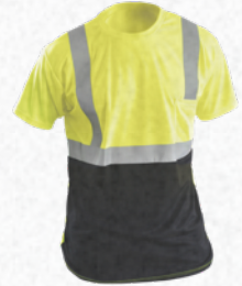
BLACK BOTTOM LUX-SSETPBK