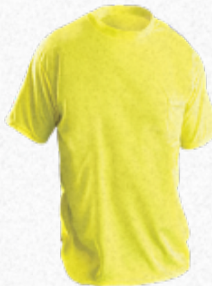
SHORT SLEEVE LUX-XSSPB