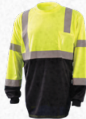
BLACK BOTTOM LUX-LSETPBK