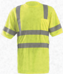
SHORT SLEEVE LUX-SSETP3B