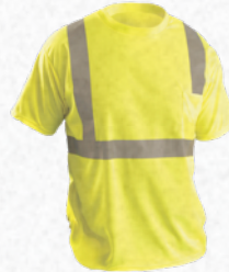
SHORT SLEEVE LUX-SSETP2B