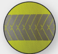
FREE SWINGING TAPE DESIGN