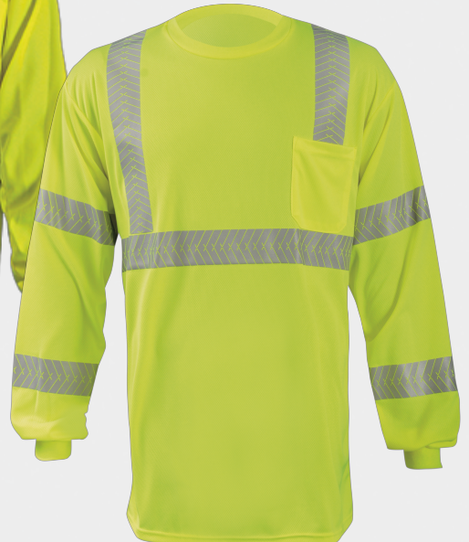
LONG SLEEVE CLASS 3 LUX-TLSP3B