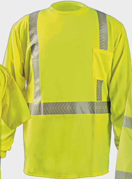
LONG SLEEVE CLASS 2 LUX-TLSP2B