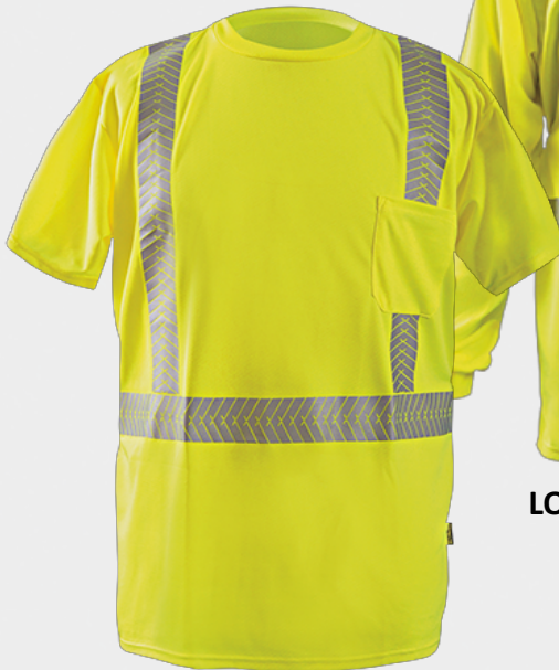
SHORT SLEEVE LUX-TSSP2B