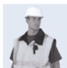
Class 2 Vest

LUX-TJBJ LUX-TJBJ-B BLACK BOTTOM (YELLOW ONLY)