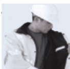
Removable Fleece Liner