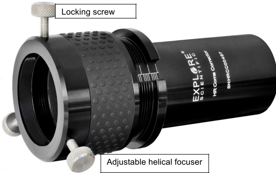
Figure 1: Front view

Congratulations on the purchase of the Explore Scientific HR Coma Correctors. You can use the HR Coma Corrector visually and photographically. When you receive the HR Coma Corrector, it is assembled for visual work. Two big parts are connected for this purpose – the base unit that includes the optical system of the HR Coma Corrector and the attached helical focuser. A small radial Allen screw secures the helical focuser. This Allen screw can be removed by using a 2mm Allen key (not part of the delivery).