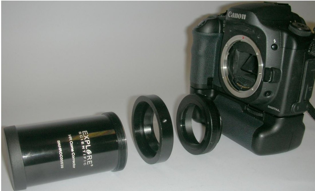
Figure 5: HR Coma Corrector with T2-Adaptor, T2-Ring and camera

For Astrophotography, the helical focuser of the HR Coma Correctors has to be removed. Remove the small radial Allen screw so that you are able to unscrew the helical focuser from the corrector body (See figure 2). You can attach the camera via two adaptors that come with your HR Coma Corrector: one adaptor with T2-thread, that you can use together with different camera bodies, like DSLRs. Please notice that you need an additional T2-ring for your specific camera model. This T2-ring is not included with the HR Coma-Corrector.