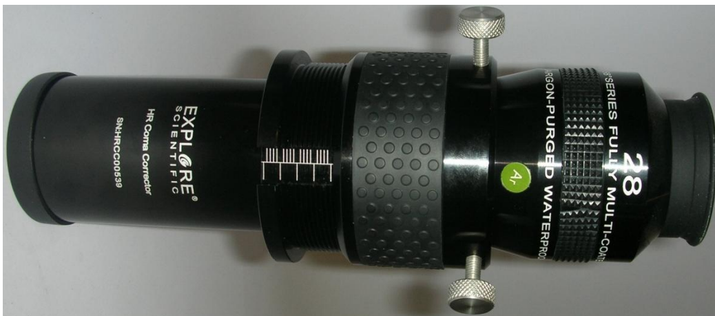
Figure 4: HR Coma Corrector with eyepiece that has a field stop 3mm below reference

Now remove the tape and insert a eyepiece into the corrector and secure it with the locking screws. Focus the eyepiece with the helical focuser by rotating the eyepiece - without touching the telescopes focuser. If you know the internal position of the field stop of your eyepiece, you can rotate directly until the correct value appears on the scale. If you – for example – know that the field stop is located 3mm below the reference surface (upper end of the eyepiece barrel), screw the helical to 13,5+3=16,5 mm and then do the fine focusing.