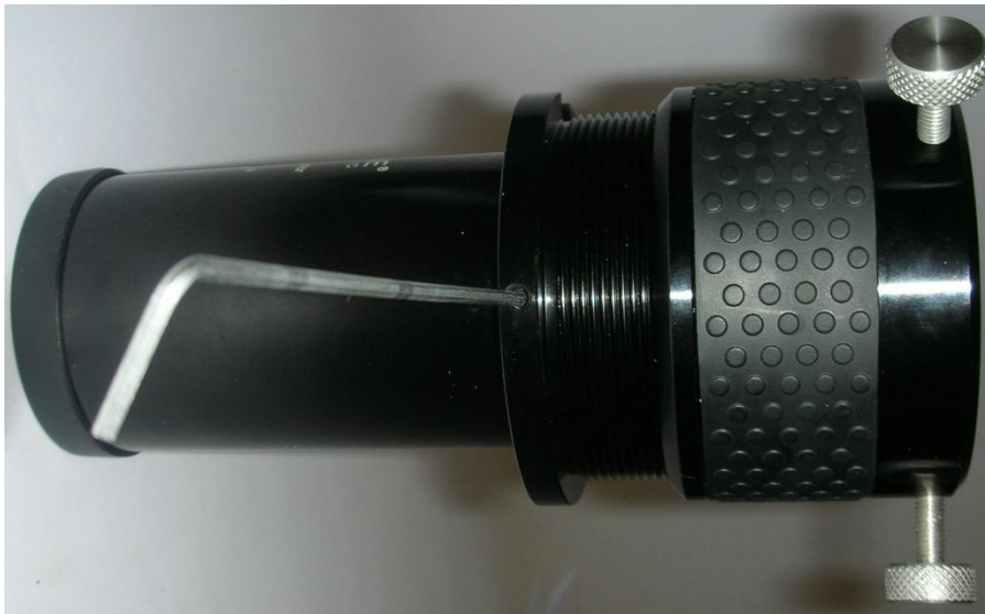
Figure 2: Back view with 2mm Allen key for the locking screw