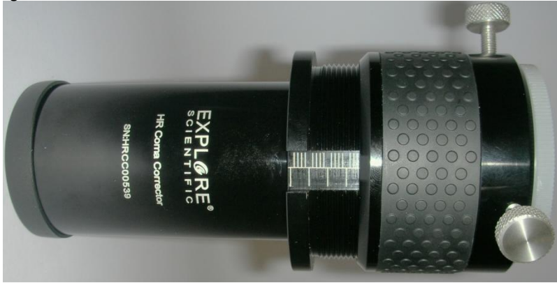
Figure 3 Zero Position

Let us configure the HR Coma Corrector first. At the side of the HR Coma Corrector you will notice a groove that contains a laser-etched scale. It shows you marks in 1mm divisions – 4 to one side and the 5 th to the other side for better overview. Screw the top end of the helical focuser out, until the rim of the movable part is 13,5mm above the lower end of the helical, as shown in figure 3.