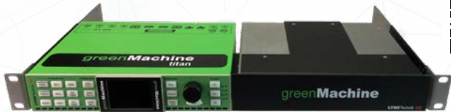
One greenMachine in Rack Mount

Note: Two power supplies can be mounted onto one RFR 6000. Please see more information in the RFR 6000 quick reference guide.