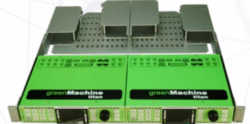
RXT 6001 installed in RFR 6000

The RXT 6001 is a compact and flexible rack extension for RFR 6000. It can be setup to hold up to four RPS A100 power supplies.