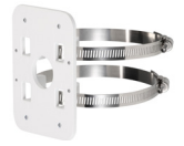
PFA152-E Pole Mount