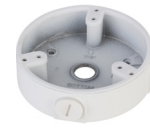
PFA137 Junction Box