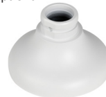
PFA106 Mount Adapter